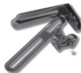
Above: included mounting hardware

Wide frequency response and high sensitivity makes it suitable for speech and background music reproduction in large areas. Typical application areas of COM loudspeakers are railway stations, subways, churches, factory buildings, warehouses and outdoor parking lots. Mainly designed for outdoor areas.