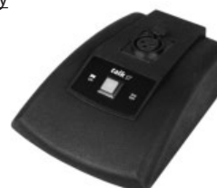
Talk ST table stand